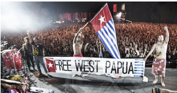
Music group Blue King Brown raise a banner in support of West Papua at a performance in Australia, 2012

Despite making strong statements of solidarity for Papuans in the past, Papua New Guinea's President did not support Papua's application to be given more than observer status at the MSG, but did support Indonesia's application to be given associate membership. Fiji's Prime Minister, Frank Bainimarama adopted the same position. 204 The decision was preceded by intense diplomatic efforts on the part of Indonesia, which are believed to have included promises to support the economic development of Melanesia. 205