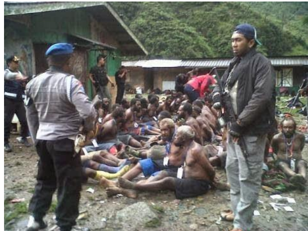
Indonesian police rounding up West Papuan villagers in the Timika area, near the Grasberg mine, 2015

When convicted, they face lengthy sentences. 125 Between April 2013 and December 2014, the human rights organisation Papuans Behind Bars reported 881 political arrests and 370 cases of ill treatment. 126