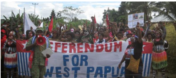
Papuans in Timika call for a referendum

An important part of Papuan grievances are linked to the 1969 Act of Free Choice, which, as highlighted in Section 1, is widely reported to have been a coercive and unrepresentative exercise that was orchestrated to ensure continued Indonesian control over Papua. Because of this, several Papuans and supporters of the Papuan struggle ask for a second consultation to take place. 241