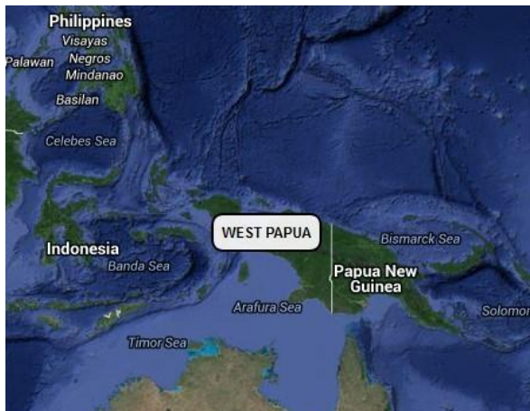
Location of West Papua region of Indonesia

The area including the Indonesian provinces of 'Papua' and 'West Papua' (referred to collectively as 'the West Papua region' or 'West Papua' in this report) covers the western part of the island of New Guinea and borders Papua New Guinea to the east. 1 The area became part of the Dutch colonial territory known as the Netherlands Indies in the 19th century. When the Netherlands Indies gained its independence as Indonesia in 1945 (internationally recognised in 1949), disagreements ensued between the newly formed country and the Netherlands on whether West Papua should be part of Indonesia. Tension escalated and open conflict broke out between the two states.