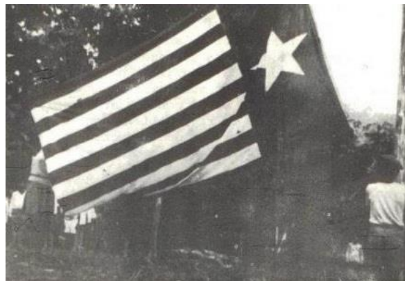
The West Papuan flag being flown at the Victoria Barracks in West Papua on 1st July 1971 when the OPM (Free Papua Movement) proclaimed Independence.

The Organisasi Papua Merdeka (OPM) is a pro-independence organisation, which launched its operations against Indonesia in 1965. 83 In the 70s, the movement gained strong support in the highlands. In order to attempt to quell this movement, the Indonesian military engaged in extremely violent operations, leaving thousands of civilian victims behind.