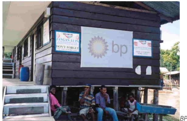
Tangguh camp in early stages of development

168 British Petroleum, Tagguh Independent Advisory Panel Report , accessible here: http://www.bp.com/en_id/indonesia/press-center/documents.html . Last accessed, 24/3/2016.