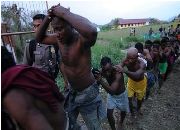
Papuans rounded up at gunpoint by Indonesian police, 2011

Underlying the human rights abuses in West Papua is the fact that the region is de facto controlled by the Indonesian military. It is estimated that around 15,000 troops are currently deployed in the West Papua region. 108 Military forces have to partly fund their own salaries, and they have strong economic interests in Papua, both in legal and illegal business. They are involved in mining and logging, as well as illegal activities such as alcohol, prostitution, and extortion. 109