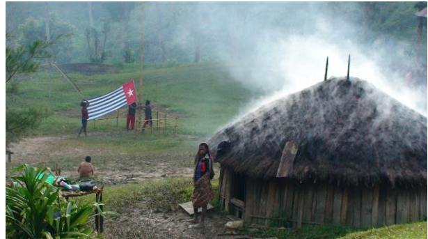
House in Wamena region with illegal Morning Star Flag

In 2001, the Wasior area was stricken by conflicts among people claiming compensation for the use of land. Unidentified groups carried out two attacks against logging companies, killing nine people, including five police officers. The authorities accused the OPM, though there are doubts about this attribution. The police's reaction was ruthless, leading to the death of eight people, the torture or ill-treatment of over a hundred other people, and the displacement of hundreds more. Amnesty International commented that 'rather than identifying and bringing to justice the individuals responsible for the attacks on the logging companies, the operation appears to have turned into a campaign of revenge against the immediate community and beyond'. 95