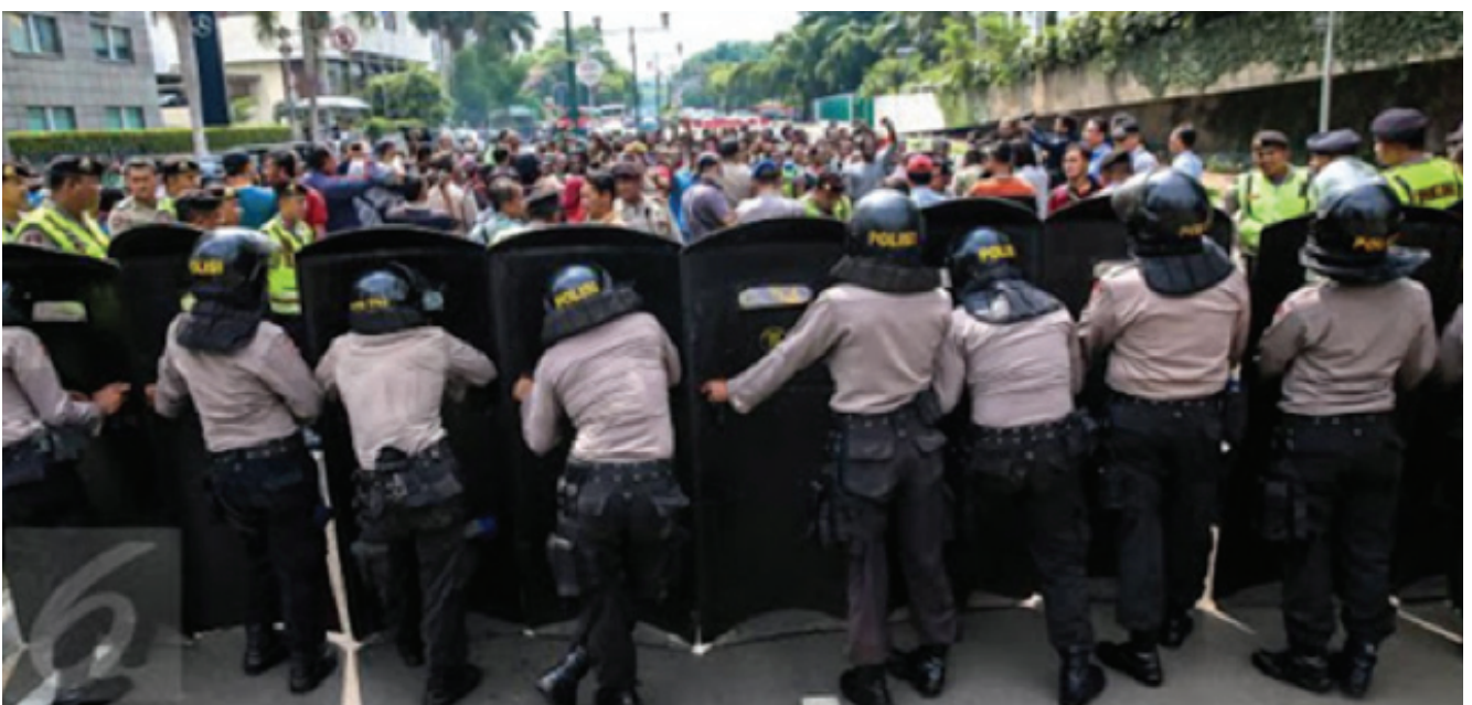
Photos taken during demonstrations in Jakarta on 1 December 2015; Source: Papua Student Alliance (Aliansi Mahasiswa Papua, AMP)