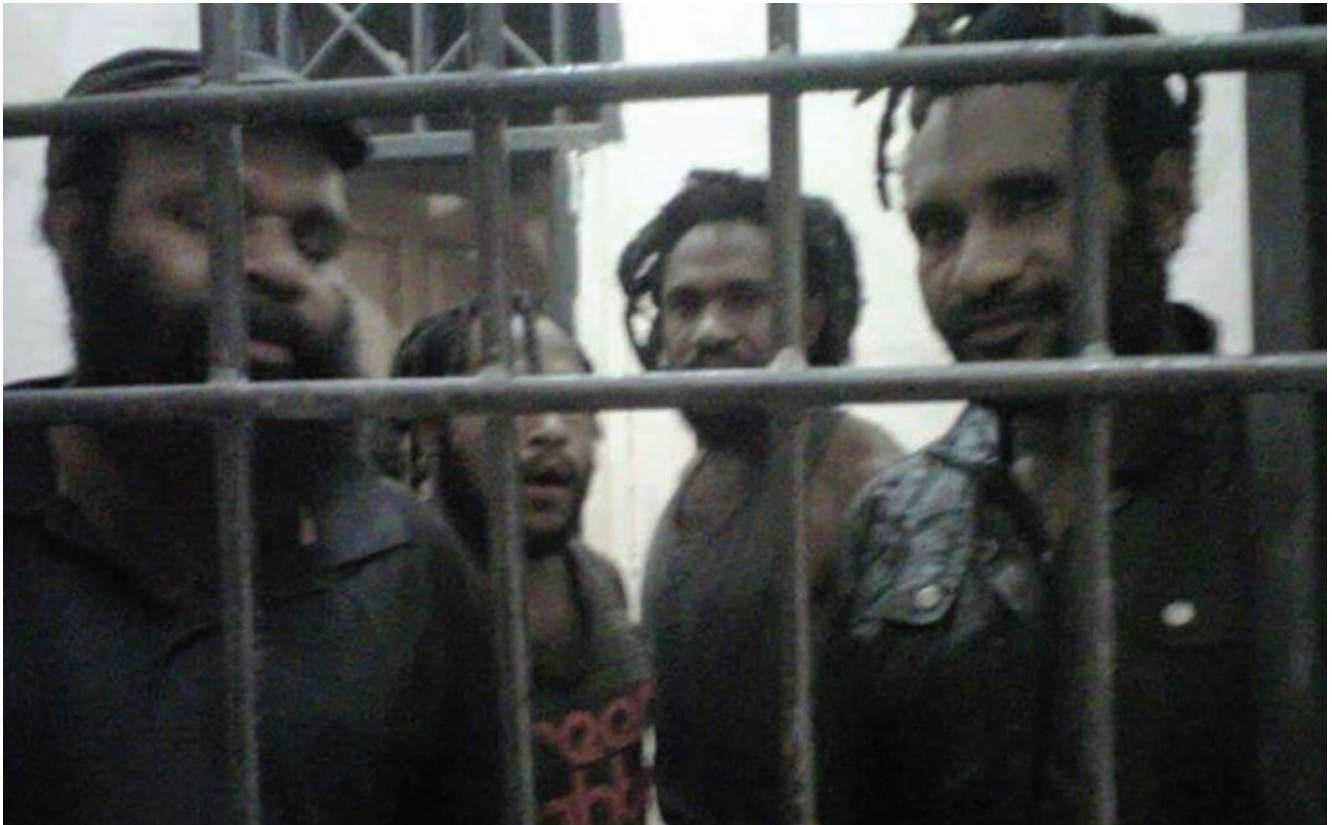
The Manokwari detainees.