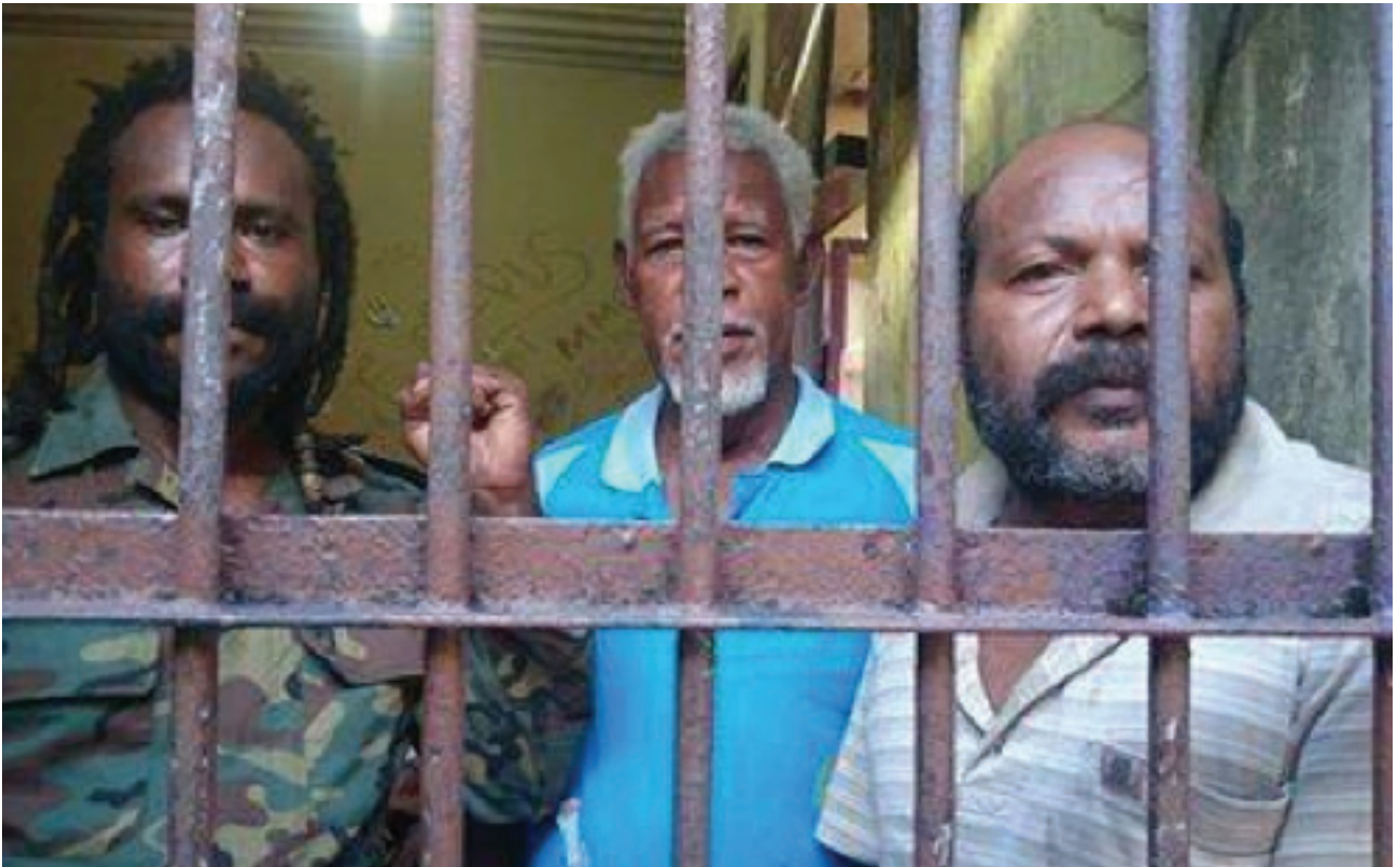
The Biak detainees